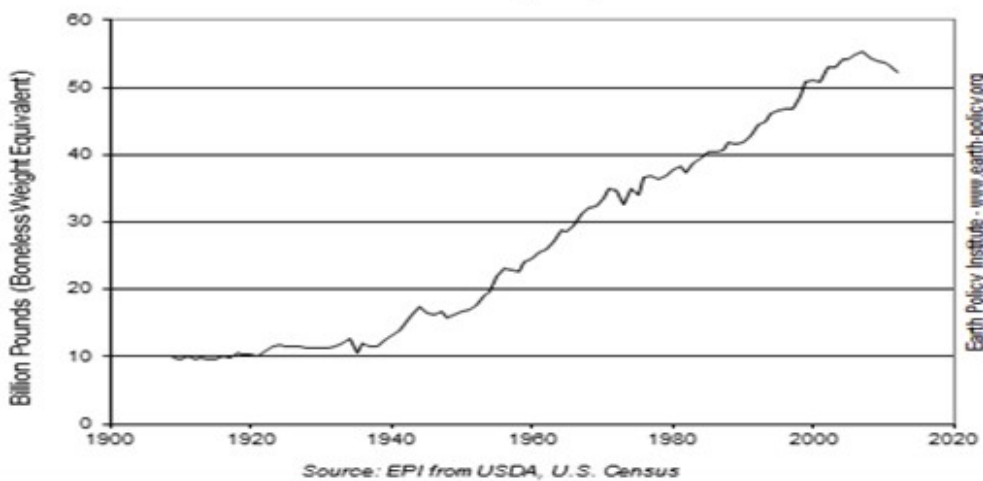
U.S. Meat Consumption, 1909-2012

As time goes on we continue to need more meat to fulfill increased demand!